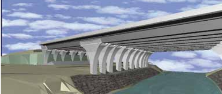
New I-25 Bronco Arch Bridge