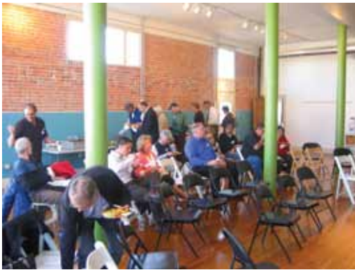
BID Open House Elliot St. Collective March 20th

The BID project involves a multi-step process to research, organize stakeholders, define the BID (boundaries, scope, budget and timelines), affirm commercial property owner support through a petition drive, and seek Denver City Council's support to form the district.