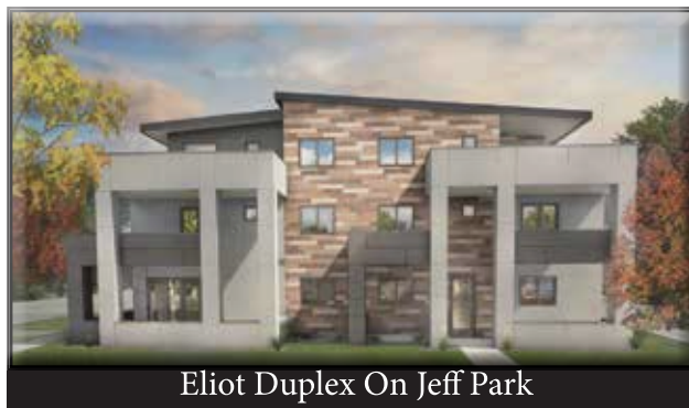
Eliot Duplex On Jeff Park

Call for more information about our exciting upcoming projects in Jefferson Park! 303.997.4001