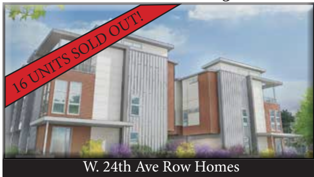
W. 24th Ave Row Homes

Call for more information about our exciting upcoming projects in Jefferson Park! 303.997.4001