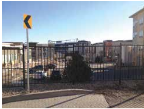
Almost 30 years later: The back alley view off of what is now called River Drive and North Bryant Street, 1986 versus 2015.