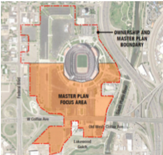
The master plan will focus on the south end of the stadium property, now occupied by surface lots used only during games and special events.