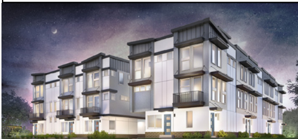
JEFFERSON PARK OVERLOOK

These beautiful units are spacious and feature large rooftop decks with panoramic views in an ideal location! Contact our office today to learn more about this development.