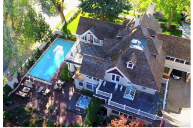
An Aerial View of Marion Manor

On April 10, Excise and Licenses will unveil new regulations for short-term rentals that it says will ramp up insurance requirements and also specify reasons for possible license removal.