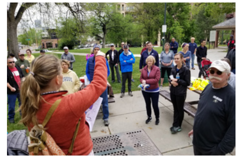
The May 2018 Community Clean-Up