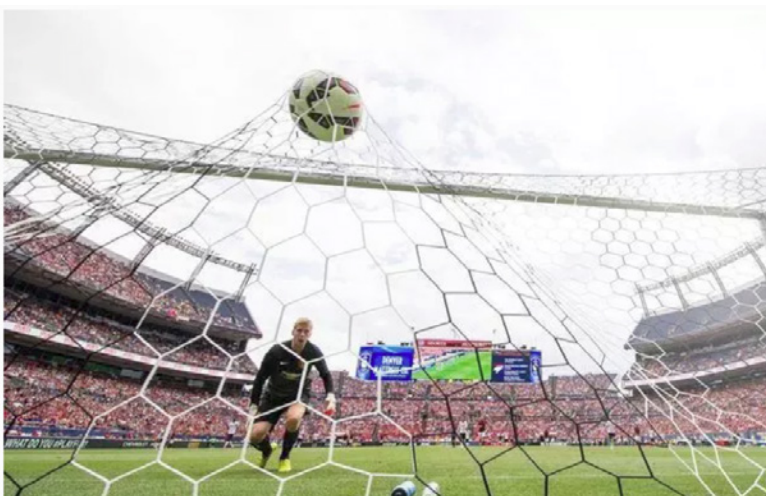
Manchester United played AS Roma in an exhibition match of the Guinness International Champions Cup at Sports Authority Field at Mile High on July 26, 2014.

DENVER IS AMONG 17 U.S. CITIES IN CONSIDERATION FOR 10 SLOTS BY FIFA