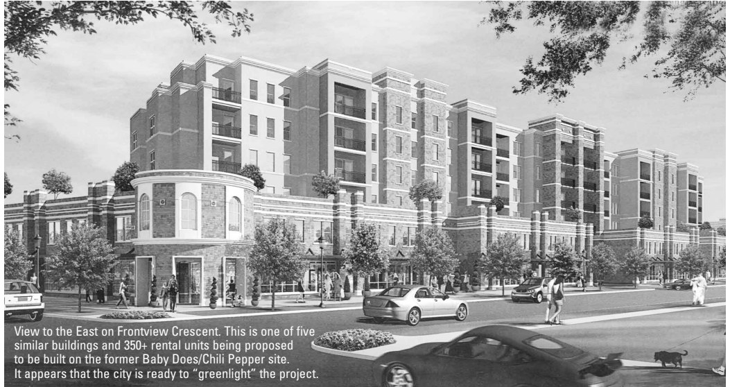
View to the East on Frontview Crescent. This is one of five similar buildings and 350+ rental units being proposed to be built on the former Baby Does/Chili Pepper site. It appears that the city is ready to "greenlight" the project.