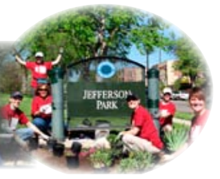
Jefferson Park United Neighbors