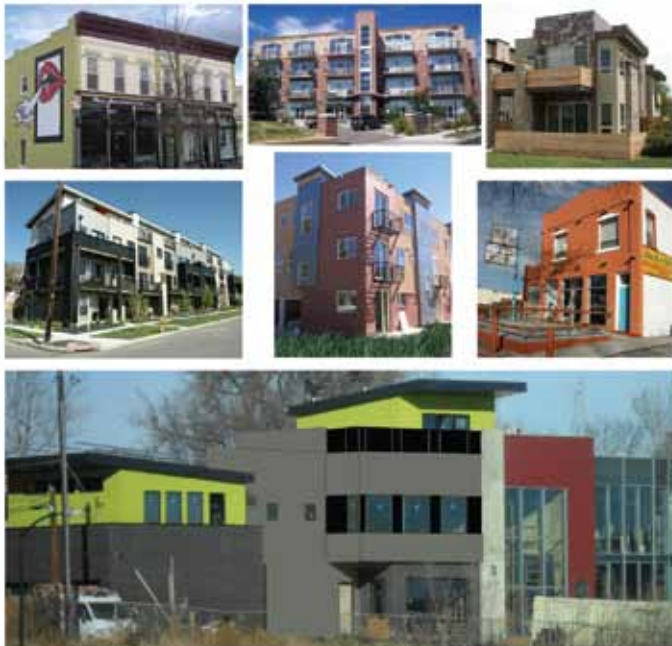
NORTH DENVER DESIGN/BUILD

REALARCHITECTURE UNREALCONSTRUCTION 2931 W. 25th Ave #101 Denver, Co 80211 Ph: 303 - 477 - 5650 www.realarchitecture.com