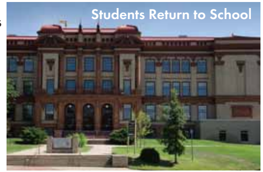
Students Return to School