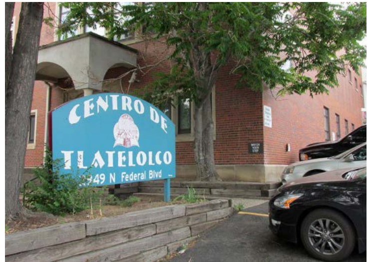
The school building fronting Federal Boulevard in the Highlands was listed for $3.95 million. (Lynn Yen)

Original article by Lynn Yen: http://www.businessden.com/2017/07/06/highlands-school-listed-4m/