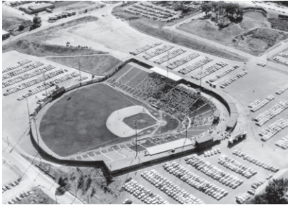
Bears Stadium occupied the land north of the current Mile High Stadium. West 17th Avenue is on the upper left. West 20th Avenue is on the lower right.

With football season approaching, at least fans no longer descend on the neighborhood trash dump. In a sense, that is the origins of Mile High Stadium. Until after World War II, the section west of the Platte River to the north of Colfax Avenue was a shanty town, Petertown. The hill ascending to the west of Bryant Street, particularly to the north of 17th Avenue, was something of a dumping area.