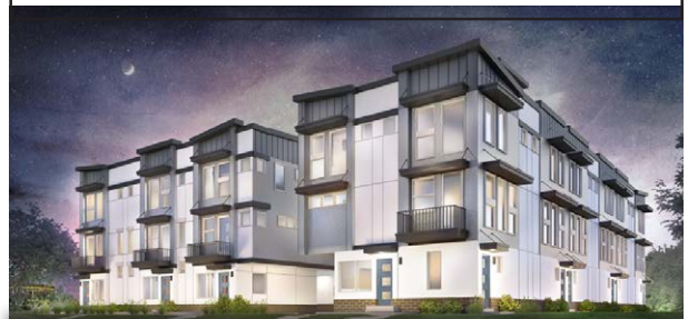
JEFFERSON PARK OVERLOOK

These beautiful units are spacious and feature large rooftop decks with panoramic views in an ideal location! Contact our office today to learn more about this newly released development.