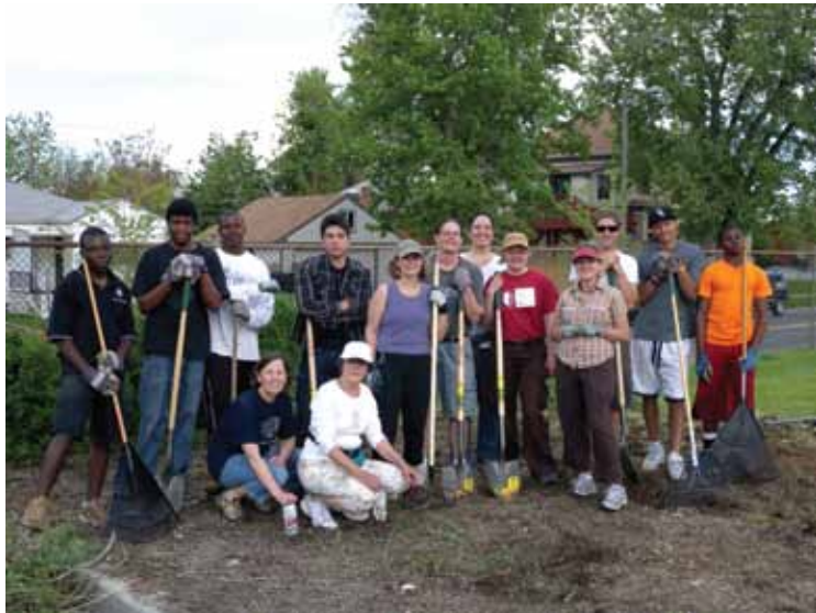
Groundwork Denver Green Team with Jefferson Park Community Gardeners at the start of last season.

One of Groundwork Denver's goals is to engage area youth, ages 14 to 24, in paid positions in the environment. In addition to activities such as community garden construction, summer employees complete a short internship at a national park. Send a cover letter resume to shane@groundworkdenver.org