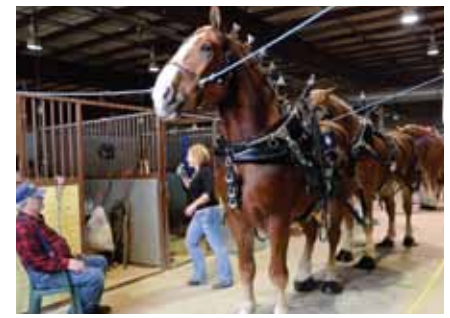
National Stock Show 2013 | Photos by Jerry Olson