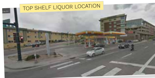
TOP SHELF LIQUOR LOCATION