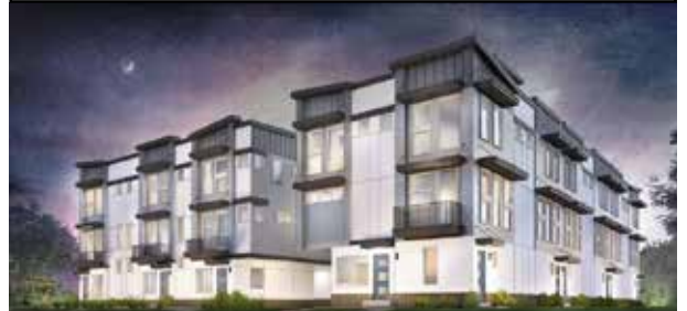
JEFFERSON PARK OVERLOOK

These beautiful units are spacious and feature large rooftop decks with panoramic views in an ideal location! Contact our office today to learn more about this development.