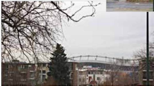
A view of Mile High Stadium from Jefferson Park.