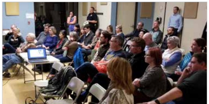
Area residents attended the January 10 town hall meeting to voice concerns and request 23rd Avenue Bridge improvements.

Based off of community input from the meeting, Jefferson Park United Neighbors, Sloans Lake Citizen Group, Federal Boulevard Partnership and Biz on the Boulevard at Jefferson Park sent a letter to Community Planning and Development. It requested the renovation of the area around the 23rd Ave. Bridge to be a high priority for projects North of 23rd Ave and West of the Platte River. The letter requested improved highway cont. on page 5 >>