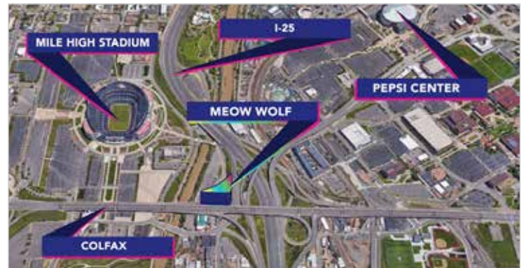
Additional content from Patricia Calhoun, editor of Westword

Meow Wolf Denver promises something for everyone. For kids, it's an imaginative experience complete with climbing, interactive light, sound, and pure creativity. For younger adults expect a concert/bar venue (800 capacity) with shows ranging from comedians to DJs, solo singer/songwriters to full bands. For the rest, Meow Wolf brings to Denver an art museum, and experience based learning and exploration. Through interaction you discover the artist's narrative, play music and activate spaces in different ways to alter the environment you're exploring.