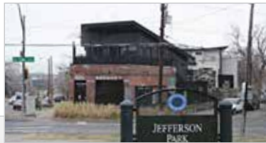
The Briar Common Brewery and Eatery near Jefferson Park.