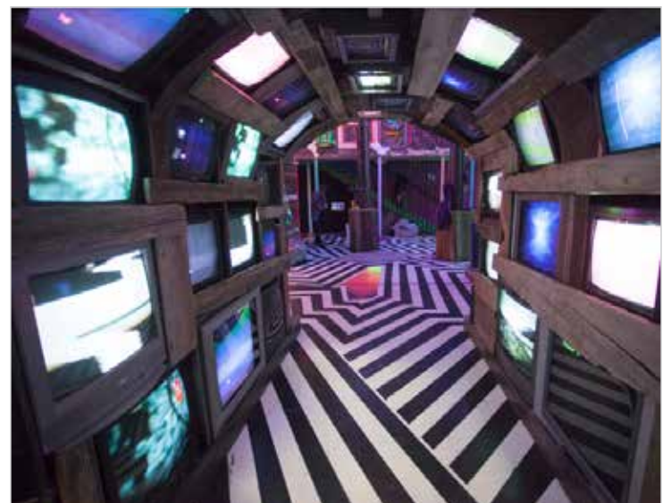
Meow Wolf House of Eternal Return

Expect Meow Wolf to energize a rather vacant and barren area. Around a half a million people visited Meow Wolf in Santa Fe and it is nearly three times smaller than the Denver site. Plans to break ground are set for the third quarter of 2018, with a projected opening date in 2020.