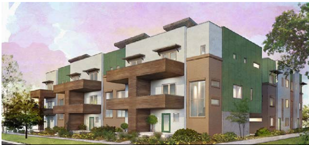
West Jeff Park

A development designed with privacy in mind. Beautiful 1326-1657 SQFT floorplans feature two or three bedrooms, enhanced by two full and one or two half-baths. Convenient attached garages are standard. Ground level en-suite bedrooms, covered patios, and balconies are available. Rooftop decks crafted for relaxation and entertaining top it all off.