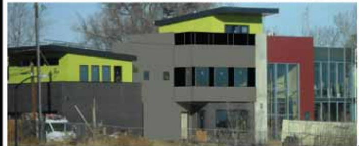
NORTH DENVER DESIGN/BUILD