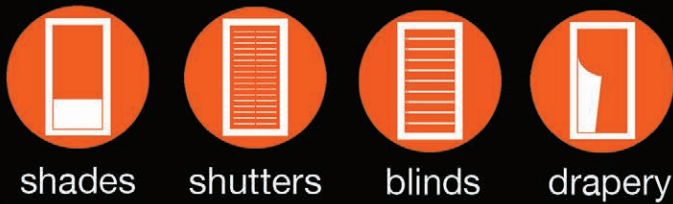
shades shutters blinds drapery