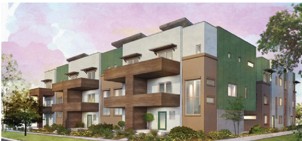
West Jeff Park

A development designed with privacy in mind. Beautiful 1326-1657 SQFT floorplans feature two or three bedrooms, enhanced by two full and one or two half-baths. Convenient attached garages are standard. Ground level en-suite bedrooms, covered patios, and balconies are available. Rooftop decks crafted for relaxation and entertaining top it all off.