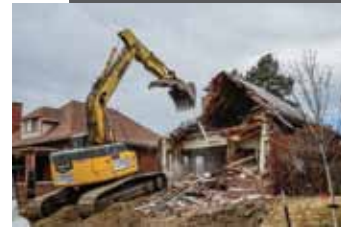
Making way for New construction 22nd & Elliot