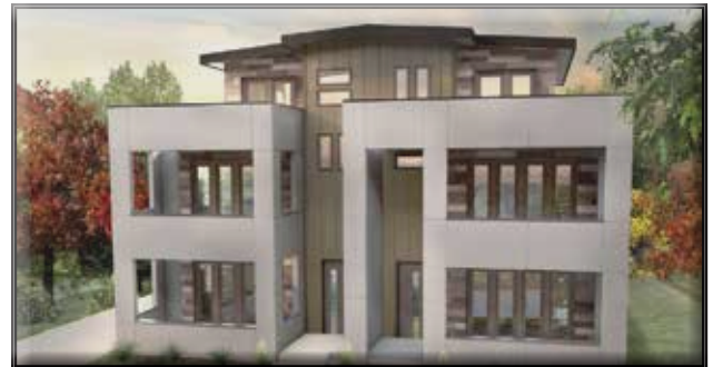
W. 22nd Duplex On Jeff Park

Outstanding 2,150+ SF new construction offers 4 bedrooms, 4.5 baths plus a lower level Rec Room....or hang out in the classy 3rd level party room with a folding glass wall opening to a deck overlooking Jeff Park. Or relax with an optional Hot Tub on the deck! Reserve now and select from the latest designer finish packages! $715K