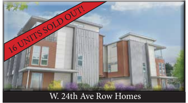
W. 24th Ave Row Homes

Call for more information about our exciting upcoming projects in Jefferson Park!