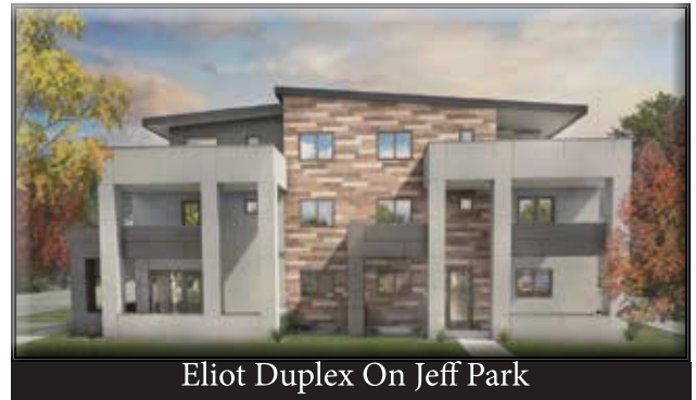
Eliot Duplex On Jeff Park

Stunning 2500+ SF features 4 bedrooms, 4.5 baths plus a lower level Rec Room. Extraordinary 3rd level party room with wet bar and folding glass wall opening to a deck overlooking Jeff Park. Deck is Hot tub optional for even more fun! Reserve now and select from the latest amazing designer finish packages! From the low $700Ks