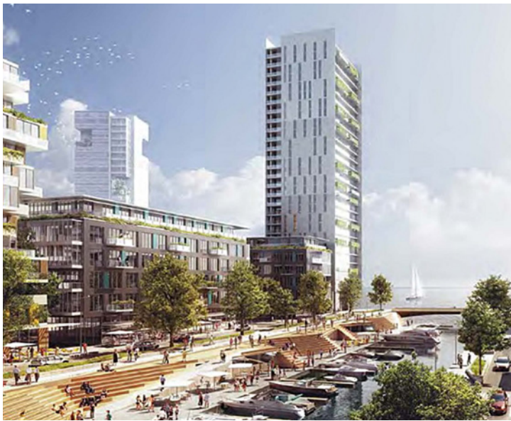
Image from Downtown Area Plan Amendment (DAPA) draft.