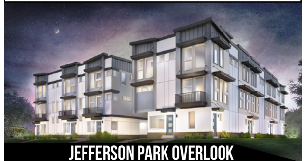
JEFFERSON PARK OVERLOOK

These beautiful units are spacious and feature large rooftop decks with panoramic views in an ideal location! Contact our office today to learn more about this development.