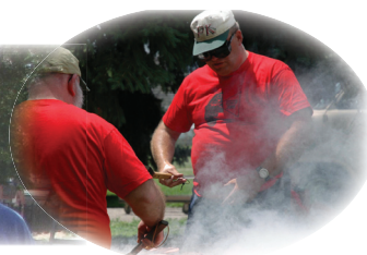
Jefferson Park United Neighbors