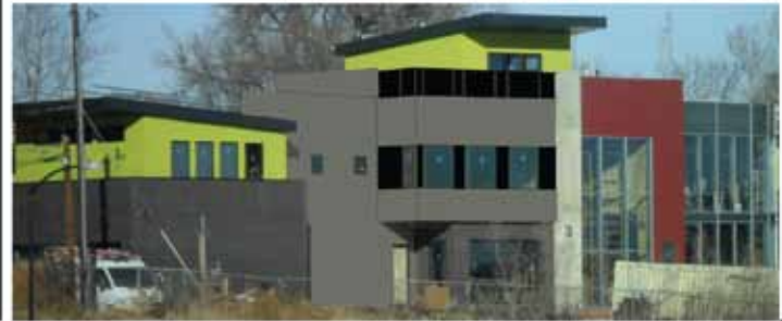
NORTH DENVER DESIGN/BUILD

Traffic Alert: If the weather is nice you can expect traffic delays along Federal during the weekend due to Cinco de Mayo celebrations. In the past the majority of the cruising along Federal has been south of 6th Ave. If cruising carries over into the neighborhood the police will block off east & west streets off of Federal to keep the cruising restricted to Federal.