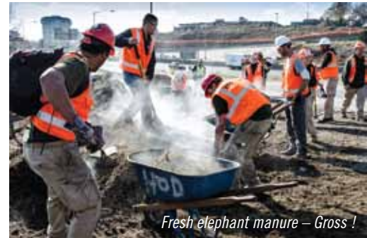
Fresh elephant manure – Gross !

By now many residents of Jefferson Park (especially those who live near 23rd Ave) have noticed a big change to the gateway area at the 23rd Avenue exit off of I-25. Tall weeds that were prevalent in that area were cut down and over a half an acre of recycled material (manure, cardboard, leaves) was laid down to accelerate the growth of native plants and grasses that only use runoff water for irrigation. By the summer of 2013 this area will showcase how permaculture can transform weed infested areas of our city.