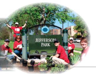
Jefferson Park United Neighbors