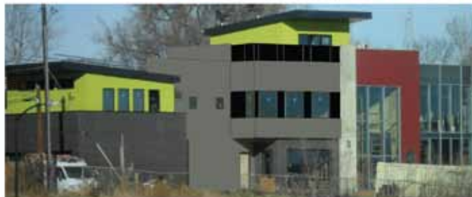
NORTH DENVER DESIGN/BUILD