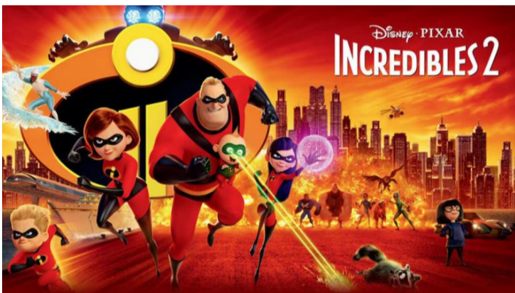
Sept 18 Movie