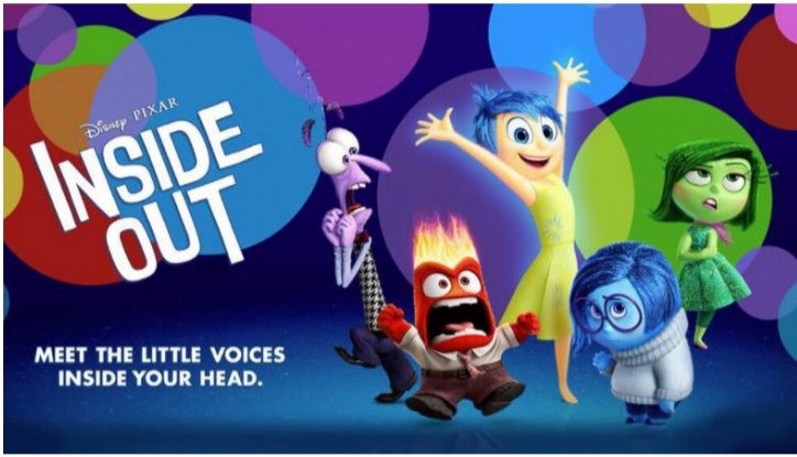
Sept 11 Movie

https://www.riversidedenver.com/drivein-neighborhood