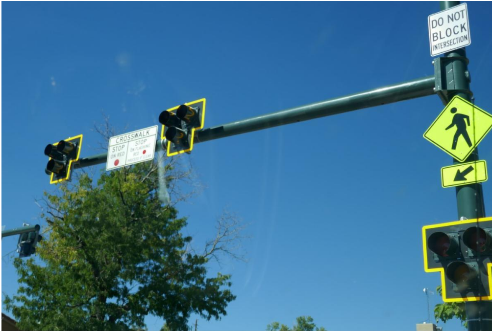
New HAWK pedestrian crossing signal across Federal Boulevard north of 25th Avenue

People on foot and on bikes will be able to activate the HAWK signal to stop vehicles traveling on Federal to cross the street more safely.