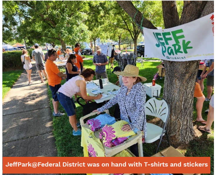
JeffPark@Federal District was on hand with T-shirts and stickers

A special thanks goes out to Jeff Park @ Federal District and the above-mentioned businesses for their continued support. This one-of-a-kind community event showcases why this is such a great neighborhood to live in.