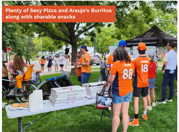
Plenty of Sexy Pizza and Araujo's Burritos along with sharable snacks