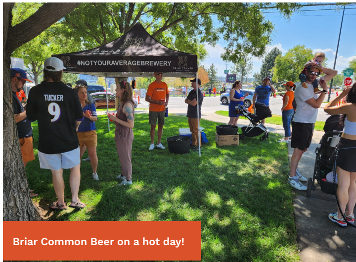
Briar Common Beer on a hot day!